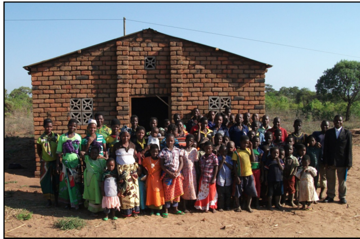
Nondwe Prayer House in Mozambique, recently provided with iron sheets by zm