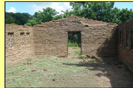
zm's church partners in Malawi and Mozambique have nearly 40 churches who have requested iron roofing sheets.